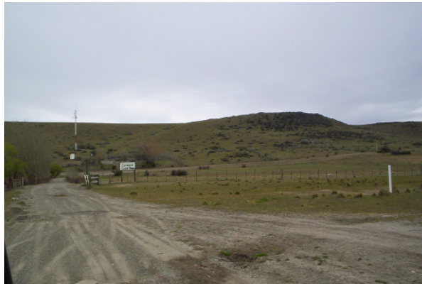
below: The entrance to the estancia where the wooden bridge had been.