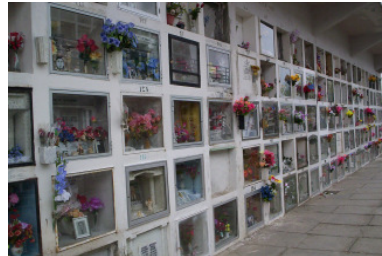
some of the 'graves'