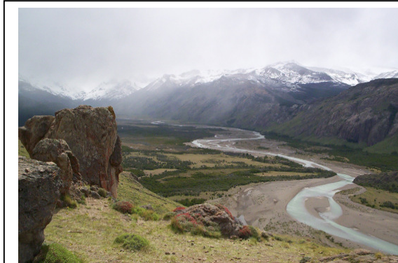
Rio Valutes (windings) from above

und then north along the Rio Liona – so named because the explorer Perito Moreno was attacked beside it by a lioness – however he was only injured not killed. And actually it was a puma not a lioness but the pumas in Patagonia are often called lions. The Rio Liona drains Lago Viedma into Lago Argentino, which incidentally is the largest lake in Argentina. At the north end not far from where the river comes out of Lago Viedma there is a small hotel – Hotel Liona, which also has some history. Butch Cassidy and the Sundance Kid hid there for about a month after their audacious robbery of the Banco de Londre y Tarapaco in Rio Gallegos in 1904. They then got over the border into Chile and so were never caught in Argentina. There are different stories about their exploits