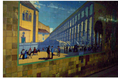
Houses in Buenos Aires and mosaic in the metro