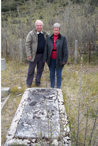
Left: the grave