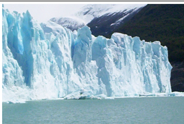
Perito Moreno on 22 nd Nov.

On 22 nd November we then had our planned boat trip on Lago Argentino to see icebergs and glaciers, and we did. The weather was fine, a good wind blowing as